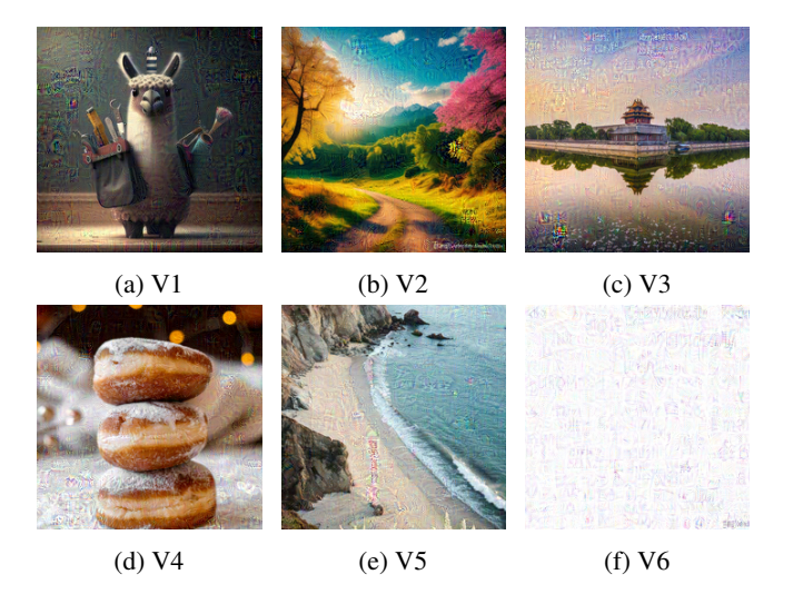
Figure 3: Adversarial images obtained after optimization.

We also observe that it is particularly hard to note the noise added to V4 (Figure 3d) because of the blurred background and the dotted frosting added to the donuts. This indicates that attackers can carefully choose the base image for optimization to reduce the chance that users recognize the added noise when necessary. However, achieving a higher SSIM is not the objective of our attack as images are intrinsically obfuscated in our context as mentioned in Figure 4.2. One may improve the similarity score by applying regularization terms to the loss function, at the potential cost of lower attack performance and longer optimization time [6].