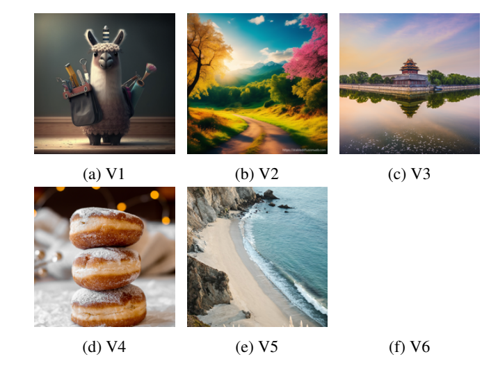
Figure 4: Base images of adversarial images in Figure 3.

Figure 4 displays the six base images we used for the image attack. The first one is a famous AI-generated picture of a llama, following four images randomly sampled from the Shutterstock<sup>9</sup> image database, and the last one is purely white.